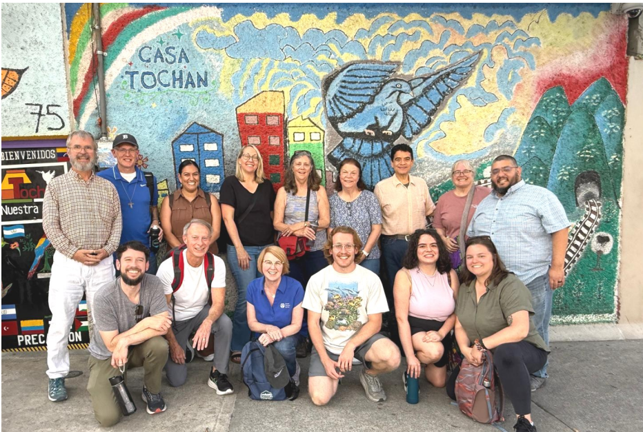
The group from the Northwestern Ohio and Grand Canyon Synods in front of Casa Tochan, a shelter for men.