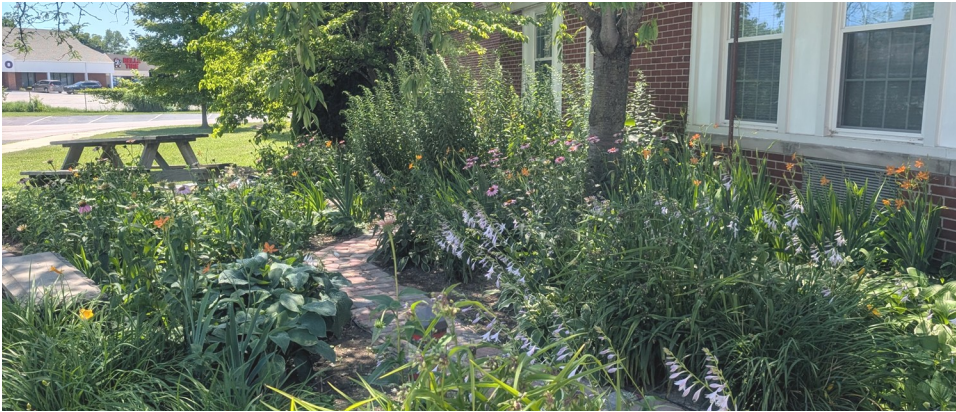
This summer, take a stroll through the perennial garden located right outside the church office entrance.

5840 Monroe Street • Sylvania, OH 43560 • www.olivetsylvania.org